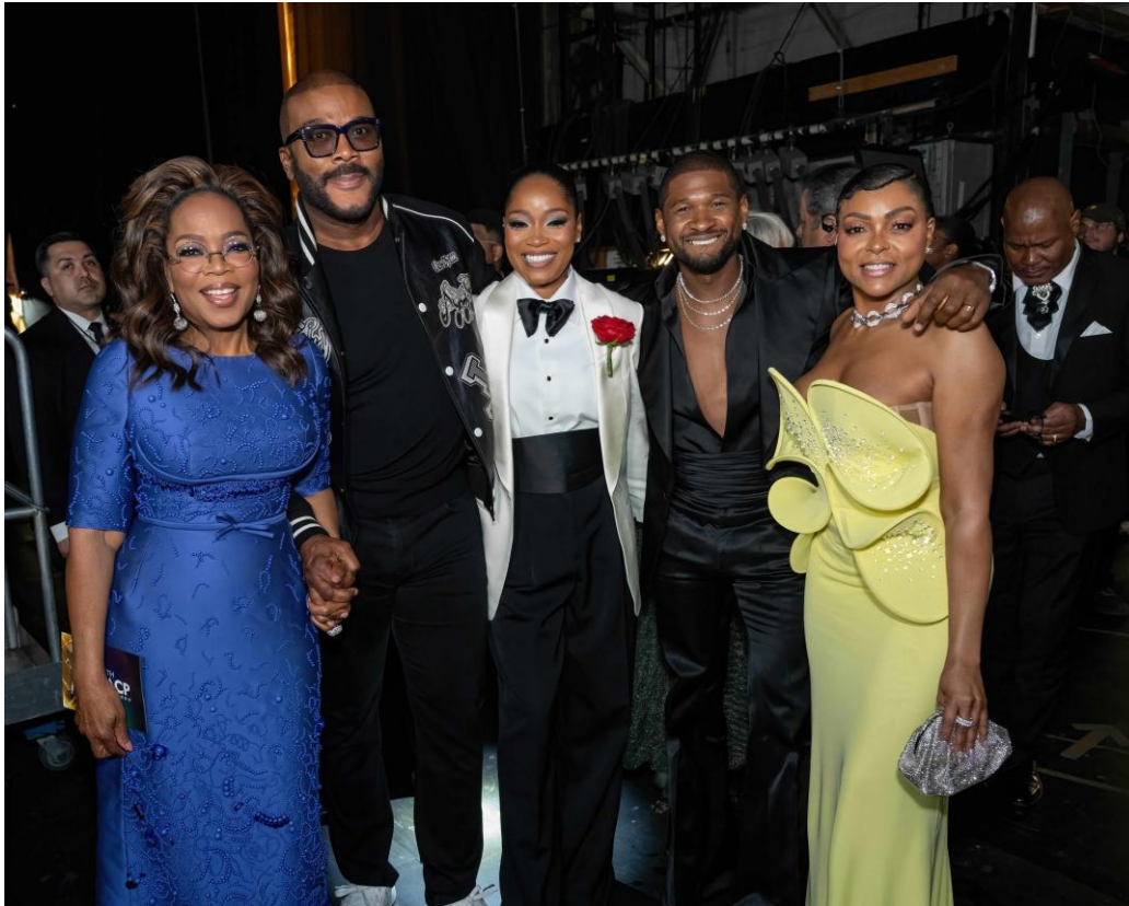
Oprah Winfrey, Tyler Perry, Keke Palmer, Usher, and Taraji P. Henson attend the 55th NAACP Image Awards.